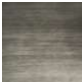
satin iron grey