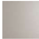
GFM70 pearl embossed