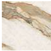
KM18 matt Borghini Calacatta