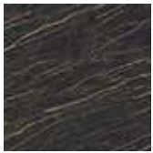
KM07 matt Portoro