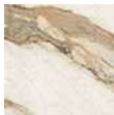
KM18 matt Borghini Calacatta