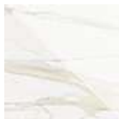
KM06 glossy Golden Calacatta