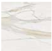
KM05 matt Golden Calacatta