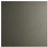
GF11 titanium embossed