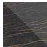
KM08 glossy Portoro