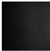
GFM73 black embossed