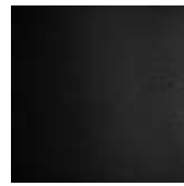
GFM73 black embossed