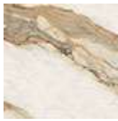
KM18 matt Borghini Calacatta