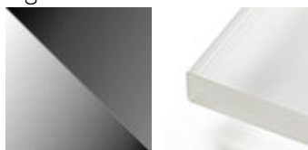
extra clear graphite