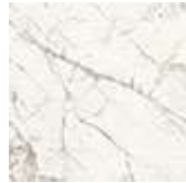
KM24 matt Invisible