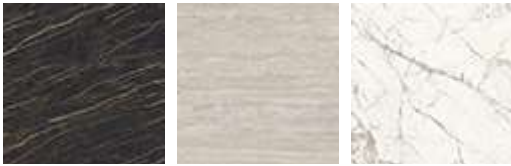
KM07 matt Portoro